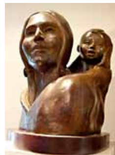
Sacajawea, bronze sculpture