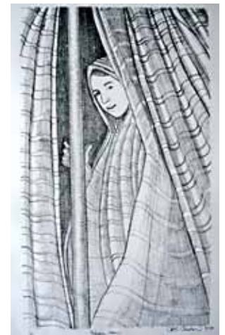
Refugee-Teen, charcoal sketch