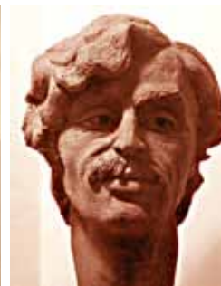
Najim, clay sculpture