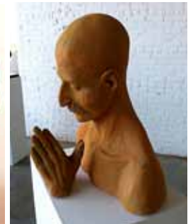
Ghandi, clay sculpture

The beauty of an artist's hand is eternal.